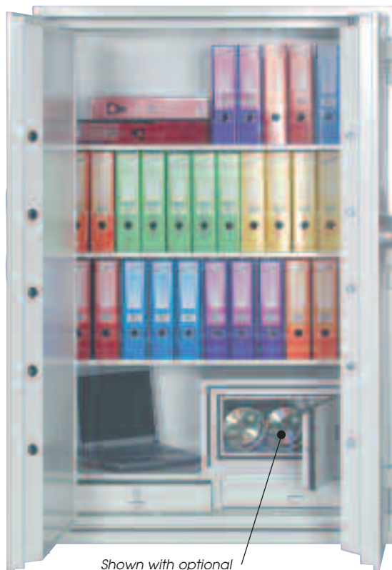
Shown with optional Data Protection insert (DPI03) for models 1902 and 1903 only.